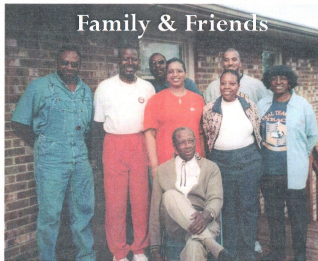
Family & Friends