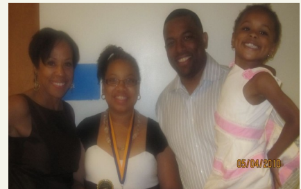
RILEY FAMILY AT AWARDS NIGHT