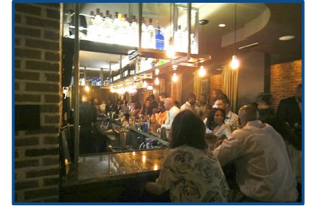
U Street Corridor