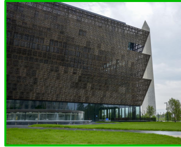
African Amer. Museum